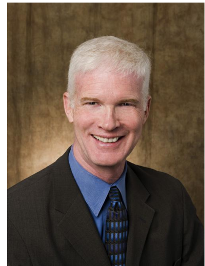
Jeff Parr Deputy Minister of Labour and Immigration